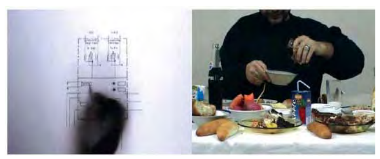
Two Taia3, 2009, two screens, reg001.

Another part of the show was installation, a builder building a brick cube 2 taya takeeb